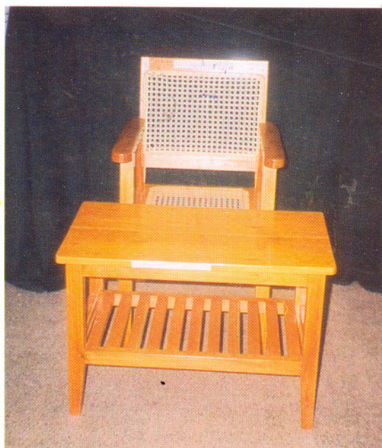
Furniture made from Acacia auriculaeformis

Progress made: Growth strain was measured in Eucalyptus tereticornis logs using hole-drilling method in which holes of 30 mm diameter are generally made on the surface of logs. It was observed that growth strain value with 30 mm diameter hole was 2.7 to 2.8 times that of 6 mm diameter hole. Average strain in logs of 10 years old trees was more as compared to 12 years. Average strain values observed in this study are higher than the Eucalyptus tereticornis obtained from Bangalore region.