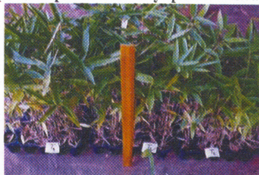
Bambusa arundinaceae seedlings in root trainers

Progress made : Standardized the potting media for Bambusa arundinaceae for quality seedling production. Experiments have been laid out for standardization of