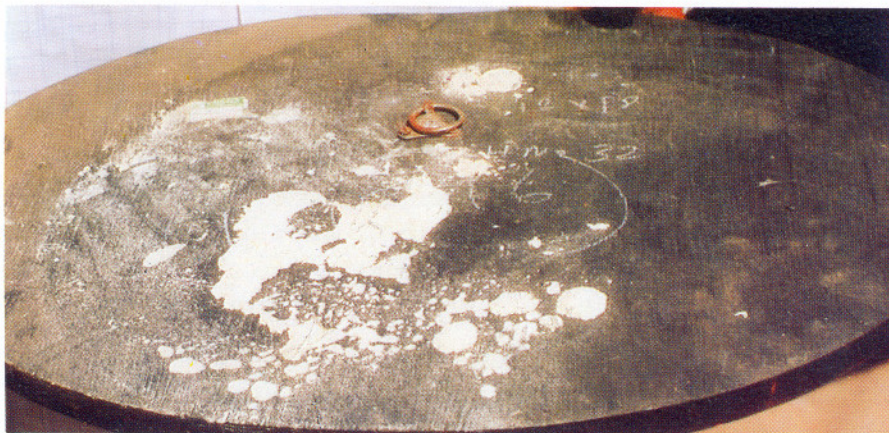
Plywood bottom wall attacked by Lycidae

Objectives : (a) To develop optimum laboratory conditions for larval development and settlement. (b) To maintain generations of organisms and larval cultures as subject specimens for various experiments. (c) To find out (preservative) chemical tolerance limits of adult molluscan borers. (d) To probe into the mechanisms that help the animals to adapt to the chemical stress. (e) To investigate the effect of chemical stress on the physiological processes and reproduction.