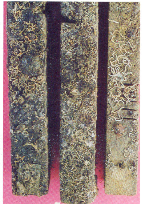
Untreated panels of Palaquim ellipticum , Macaranga peltata