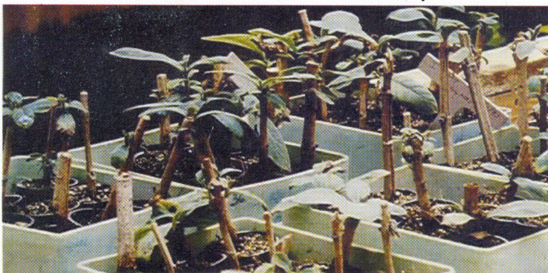
Teak branch cuttings from clonal multiplication garden under rooting in the mist chamber

Achievements : Culling operation for 25.8 ha in Teak SPA completed. Standardised potting media for Bambusa arundinaceae and Ceiba pentandra for quality seedling production in root trainers.