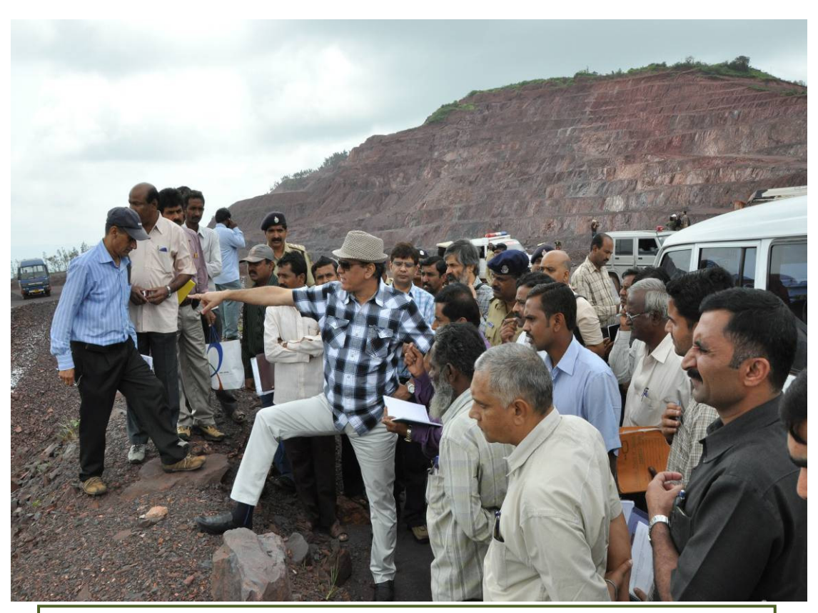
Dr VK Bahuguna visiting mines in North East Block on 27<sup>th</sup> August 2011