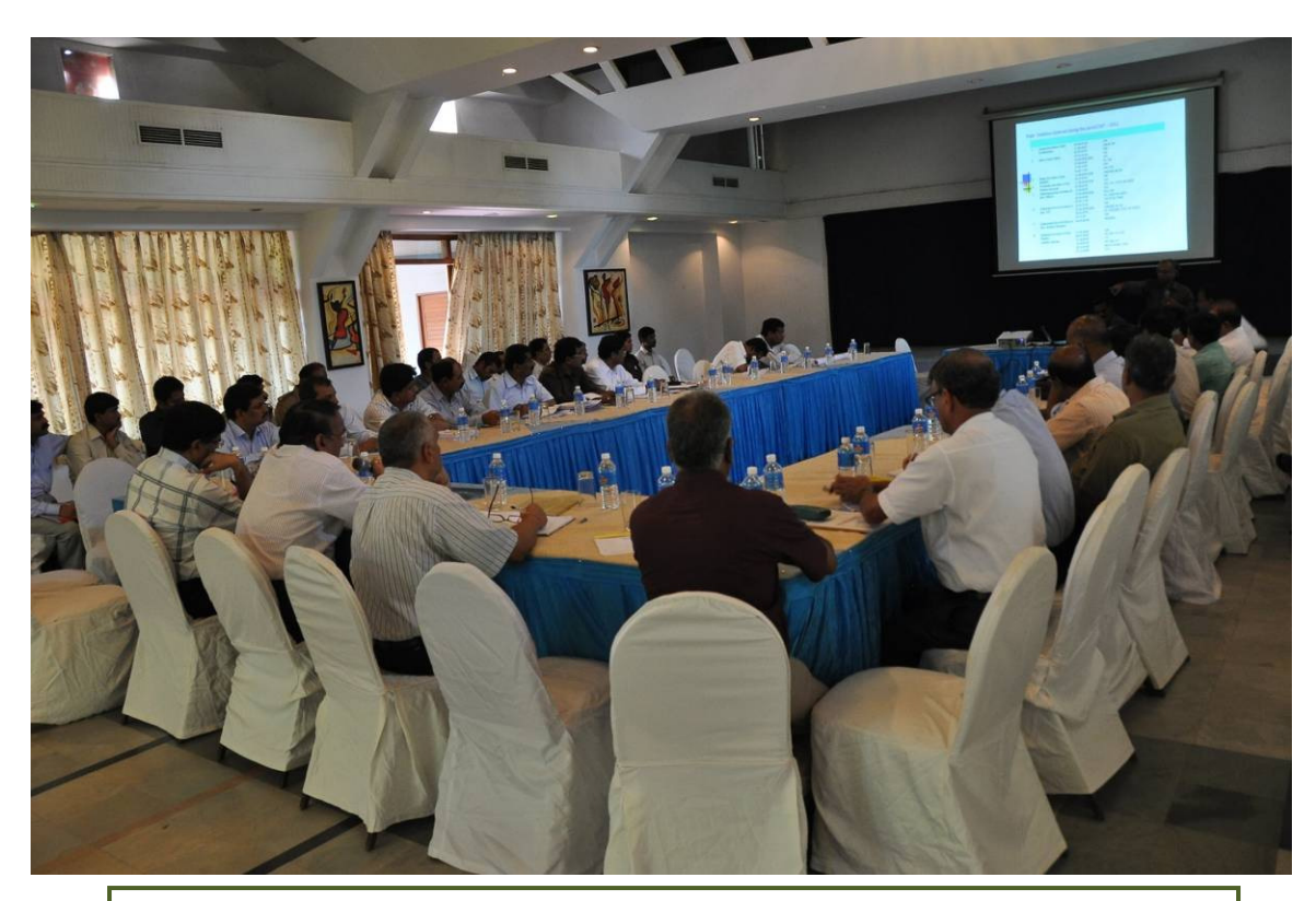
Director, Mine Safety Making presentation about mining in Bellary