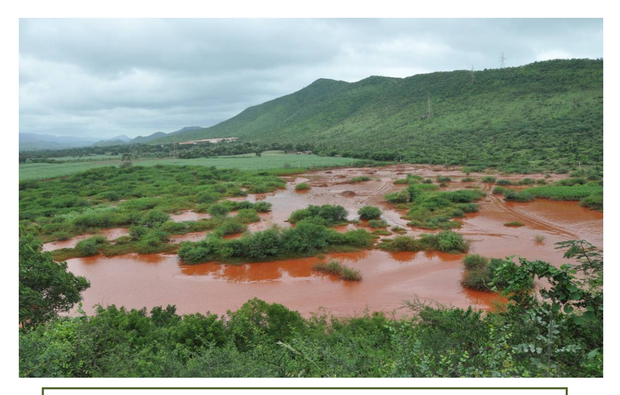
Dr VK Bahuguna inspecting the impact of mining on down stream areas