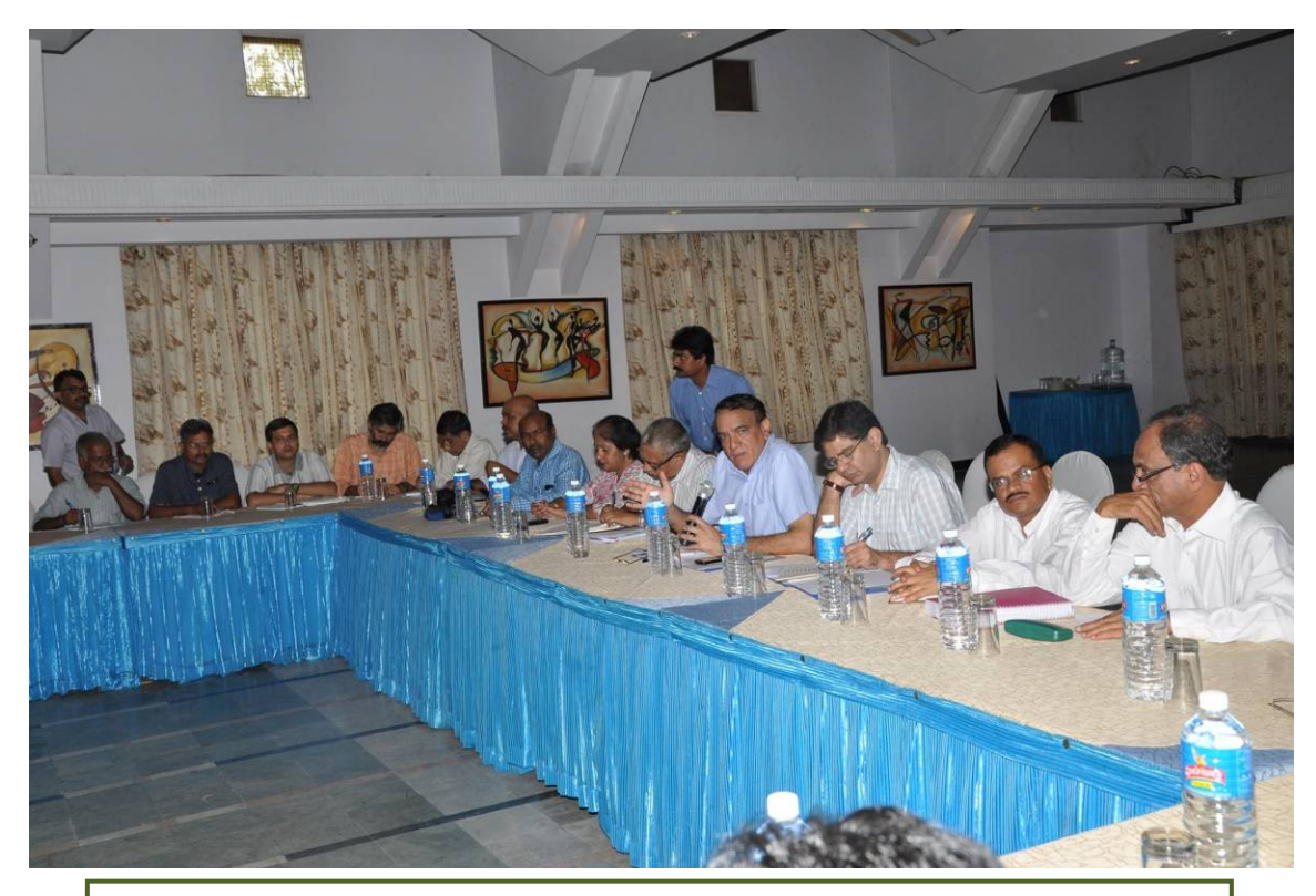
District officials, Bellary Making presentation