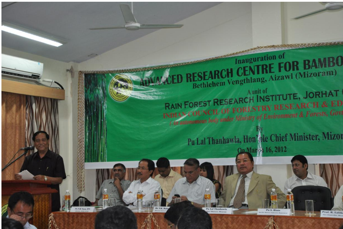
Pu S. Hiato, the Hon'ble Minister of Industries, Mizoram delivering his speech