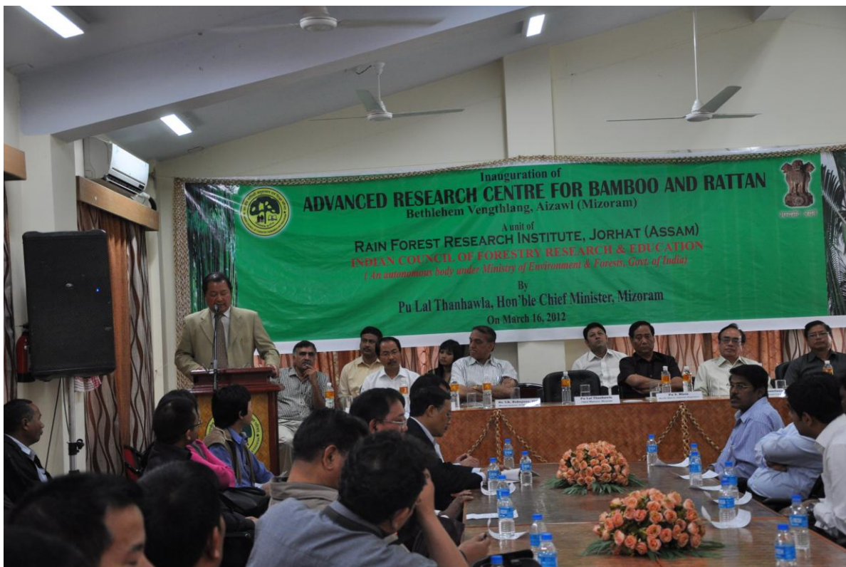
Pu Lal Thanhawla, the Hon'ble Chief Minister of Mizoram delivering his inaugural address