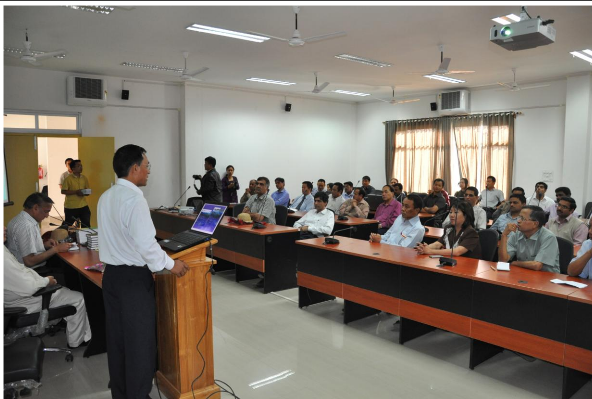
A section of Faculty members, researchers and others