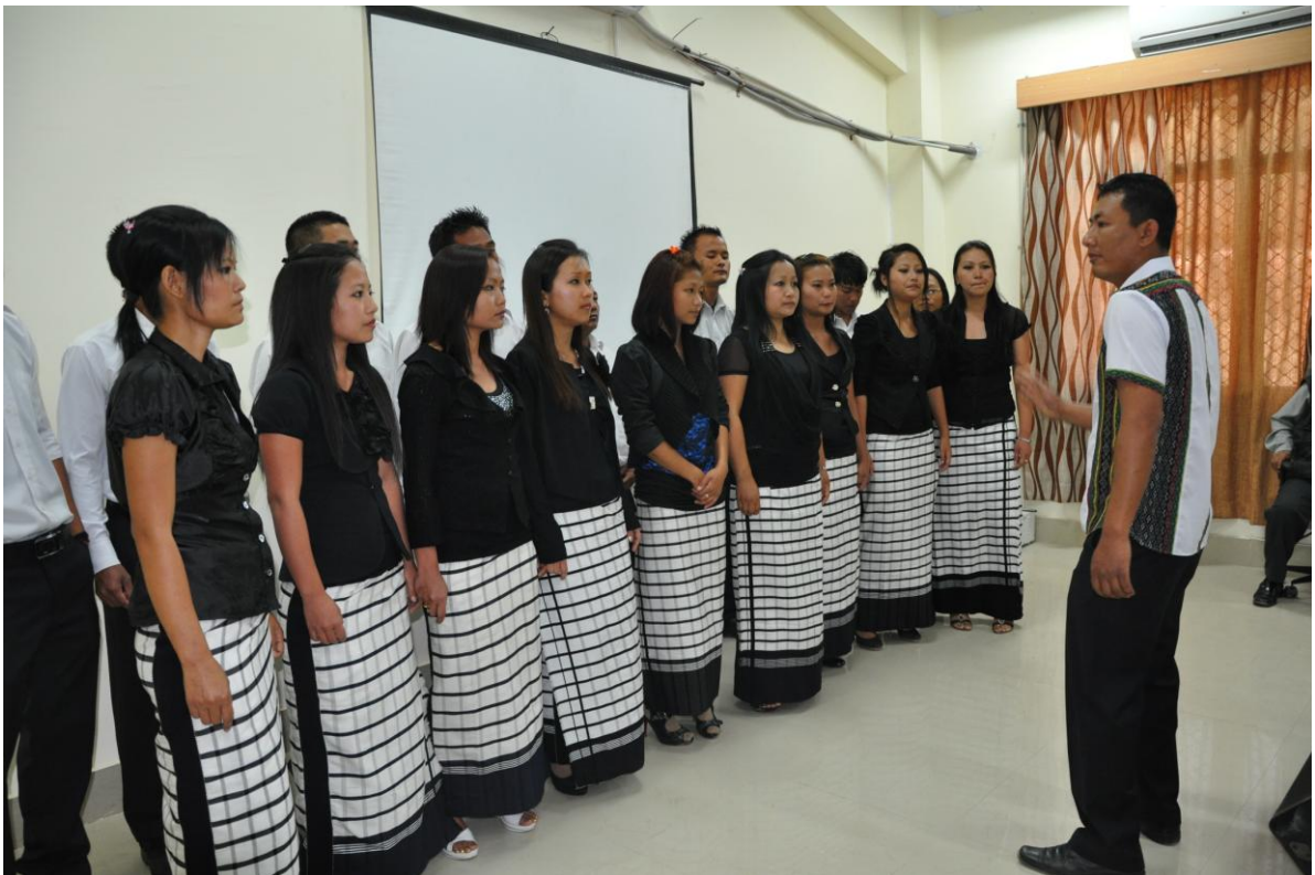
Welcome Song performed by Young Mizo Association Choir, Bawngkawn Branch