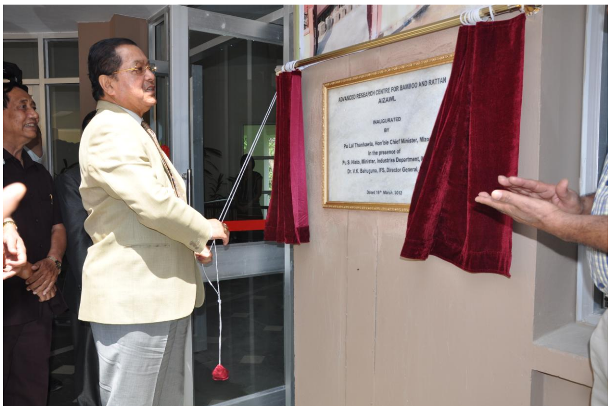
Pu Lal Thanhawla, the Hon'ble Chief Minister of Mizoram inaugurating the ARCBR Complex