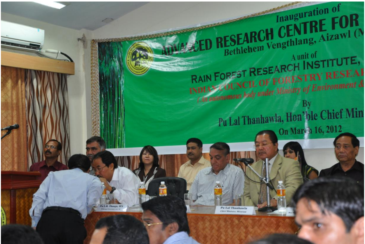
Dignitaries in the Dias