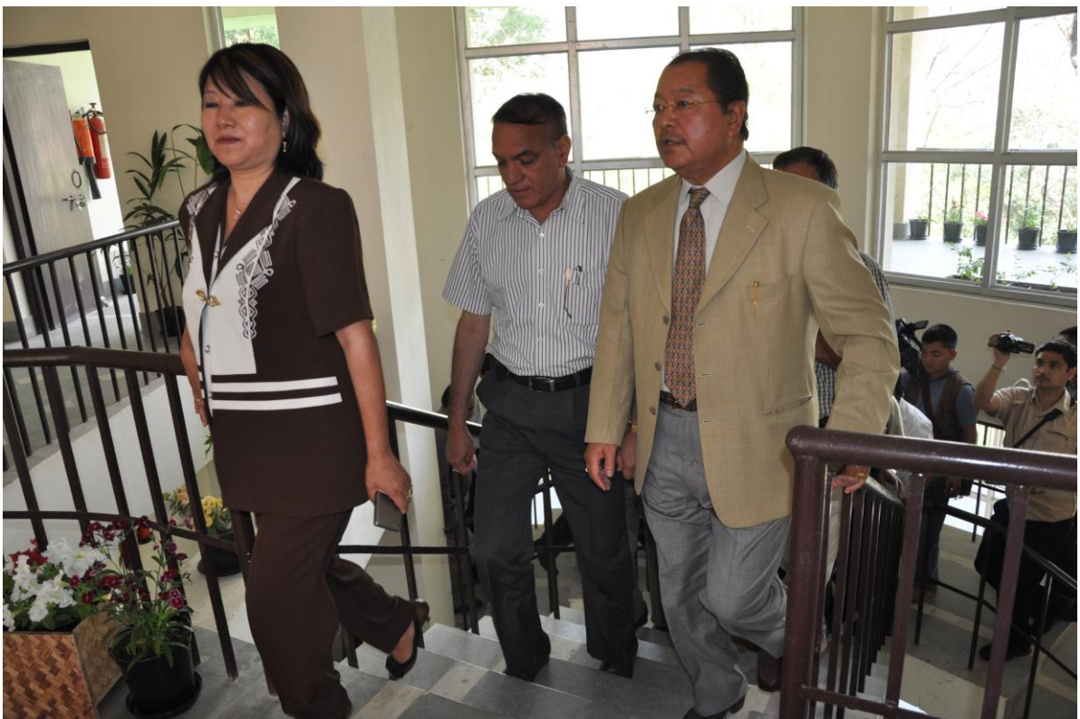
Pu Lal Thanhawla, the Hon'ble Chief Minister of Mizoram inspecting the ARCBR Building Complex