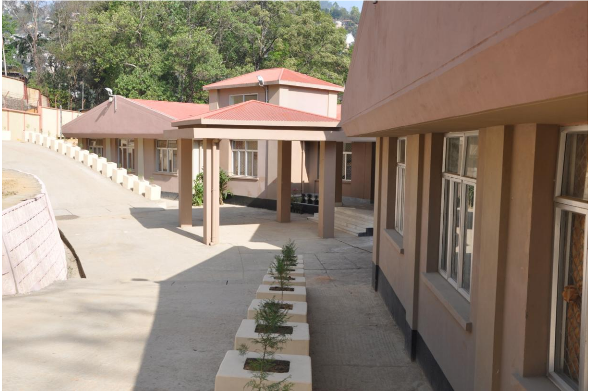
New Institute building