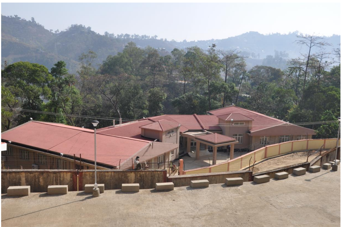
New Institute building