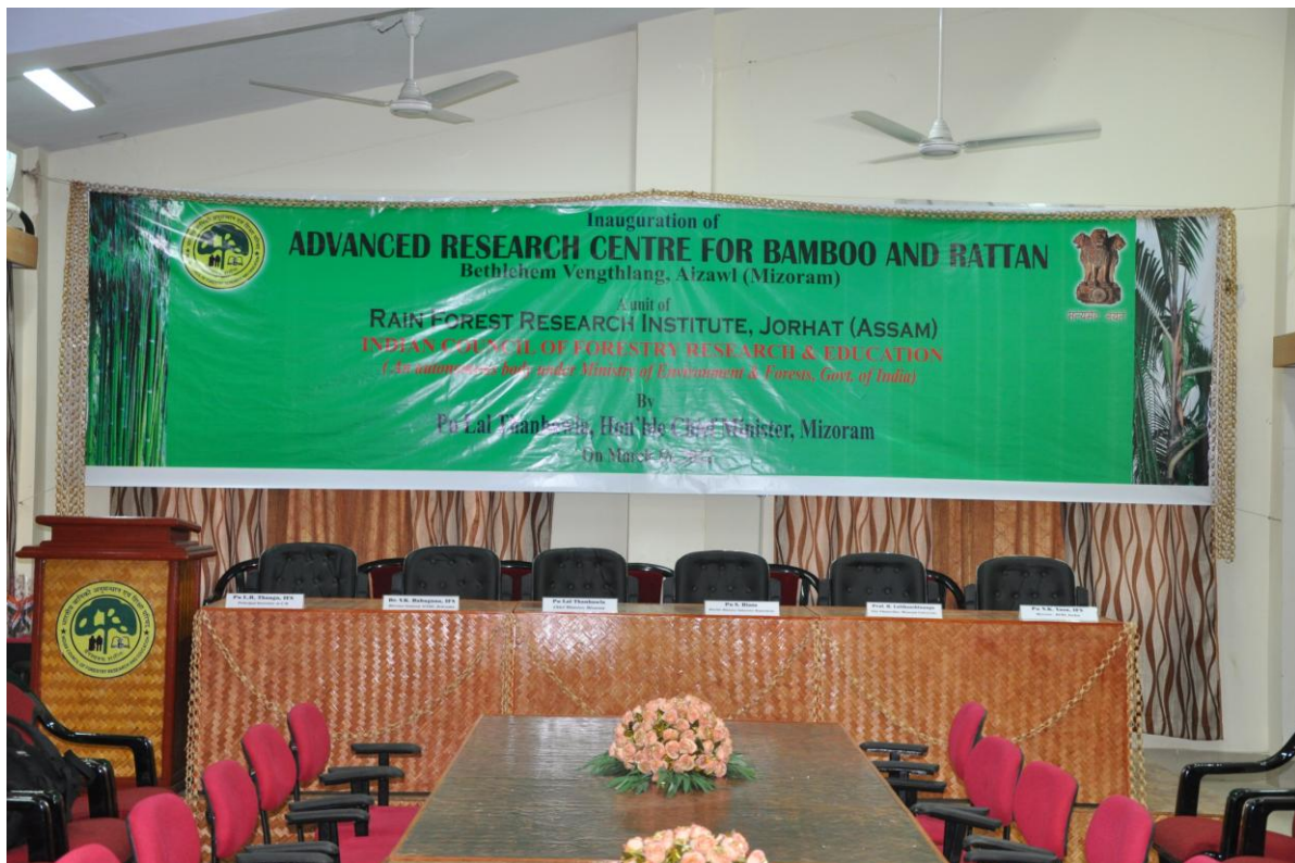
Banquet Hall waiting to receive the distinguished guests