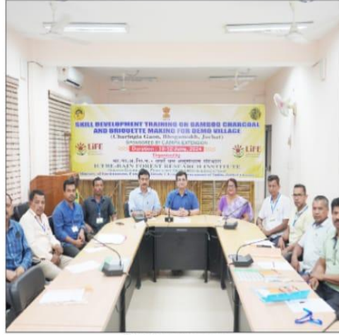
The training programme